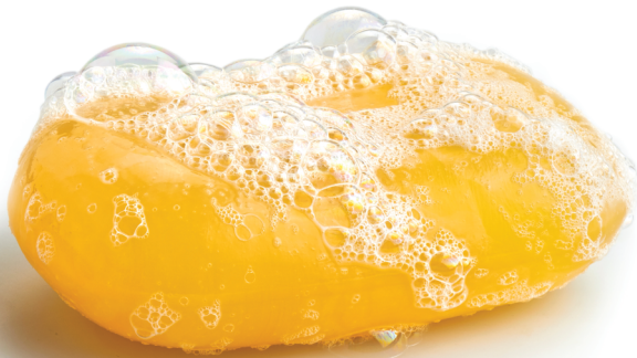
Wash your hands.