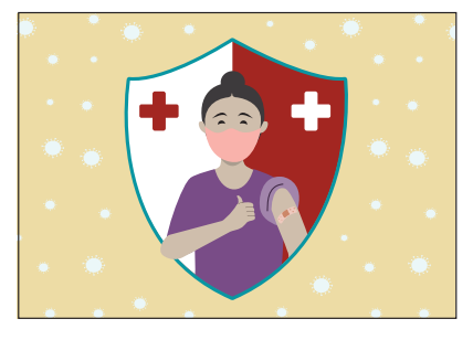
Then I will get a bandage on my arm.