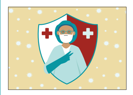
They will tell you if you need another shot to stay healthy.