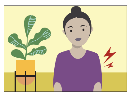
I might have a red spot from the shot. My arm might be sore. I might feel tired, have a headache or fever.