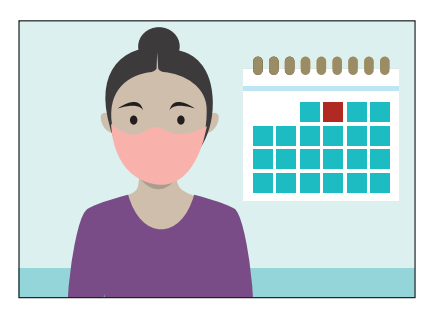
When it's my turn, I can get my shot to stay healthy.