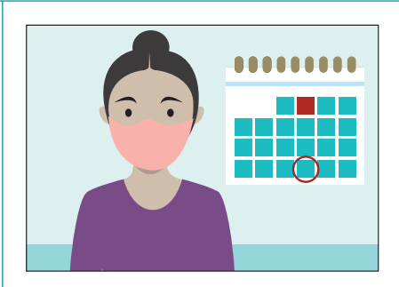
You might need to come back in 3 or 4 weeks for a second shot, and . . .