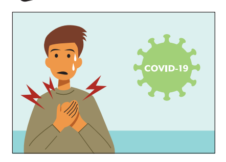
COVID-19 is a virus that has made many people sick. Some people have died.

If you have any questions or need help, call the COVID-19 Call Center: 1-866-779-6121. The center is open all day and every day.