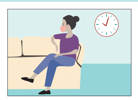
I will check in. I will sit and wait for my turn.