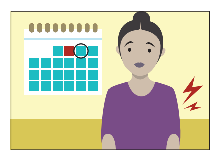
After a day, if my arm is still red and sore, and I still feel sick. . .