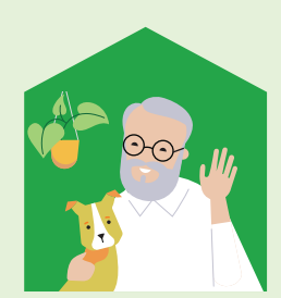
COVID-19 vaccine protects me, my family, my friends and other people.