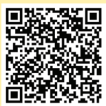
FDA Emergency Use Authorizations